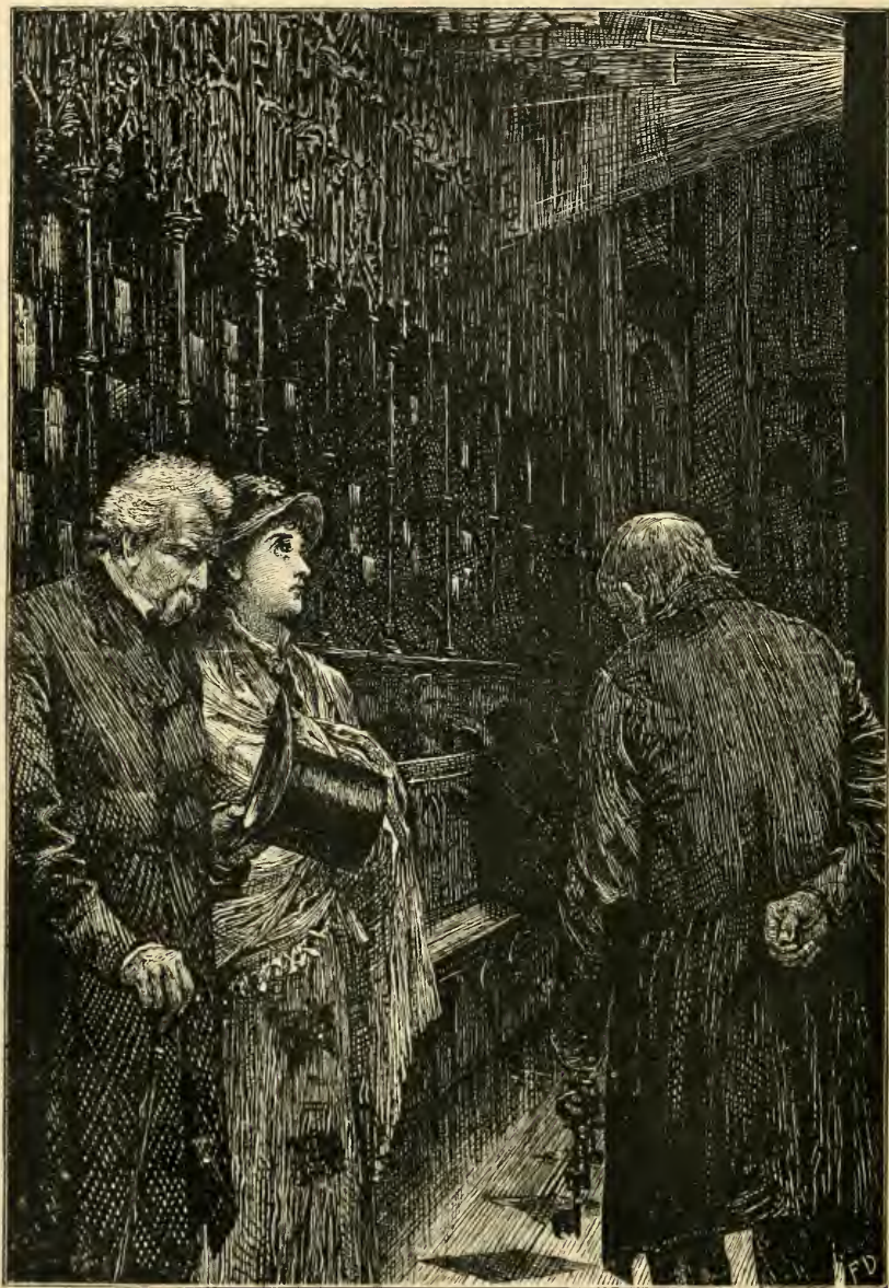
SHE STOOD AND LISTENED, FEELING ALL HER TROUBLES CALMED.